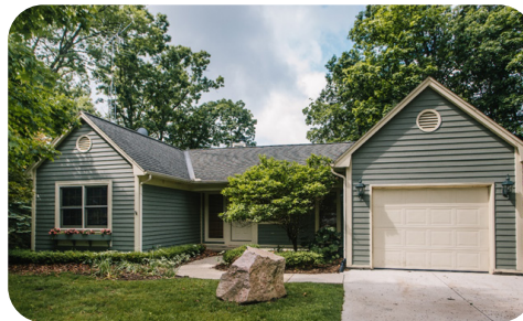
The John Kelly Home